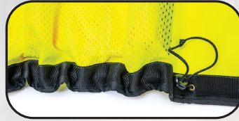
Plastic drawstring toggle spring to adjust waist area for desired fit