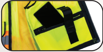
Lower inside zippered pockets with load-bearing strap for notebook or iPad®