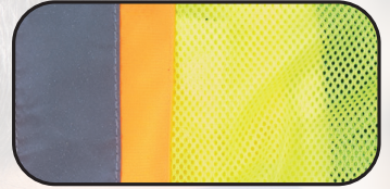
Back is made of polyester mesh for comfort and climate control