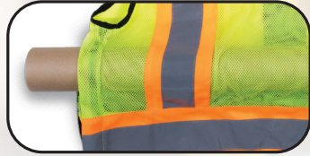
Back pouch with dual heavy-duty zipper for additional storage of documents or blueprints